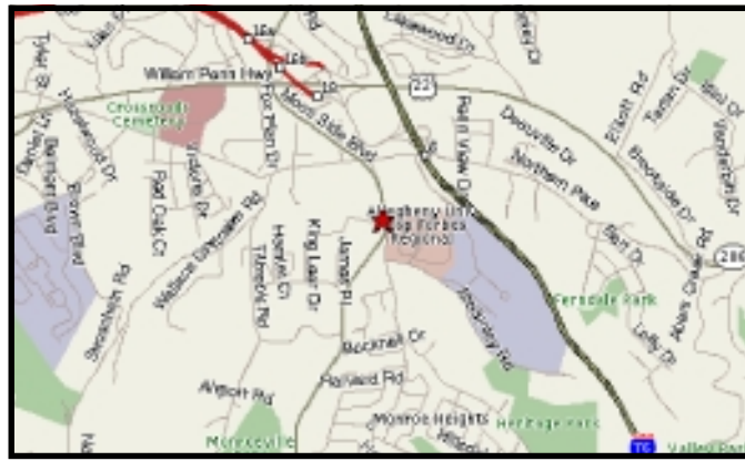
Map of area surrounding Gateway High School

PRESORTED STANDARD U.S. POSTAGE PAID Pittsburgh, PA Permit No. 5506