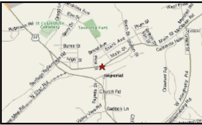
Map of area surrounding the Findlay Recreational Center