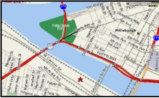
Map of area surrounding the Sheraton at Station Square