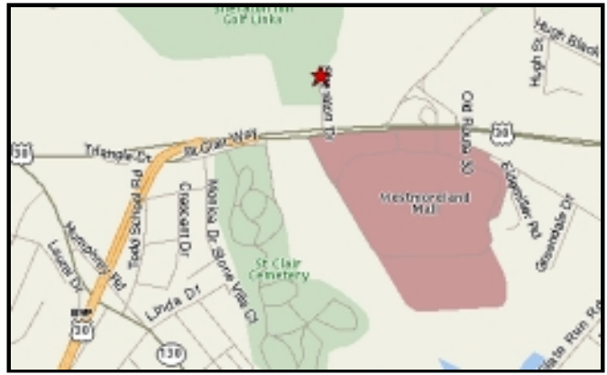
Map of area surrounding the Four Points Sheraton