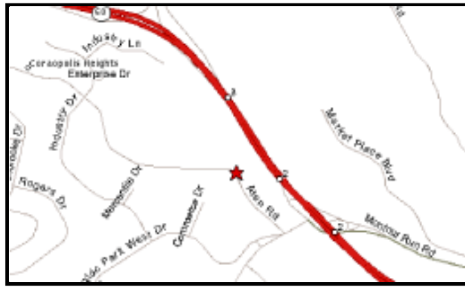
Map of area surrounding Wyndham Hotel

Presorted Standard U.S. Postage Paid Pittsburgh, PA Permit No. 5600